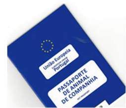
Figure 1 – EU-Pet Passport.